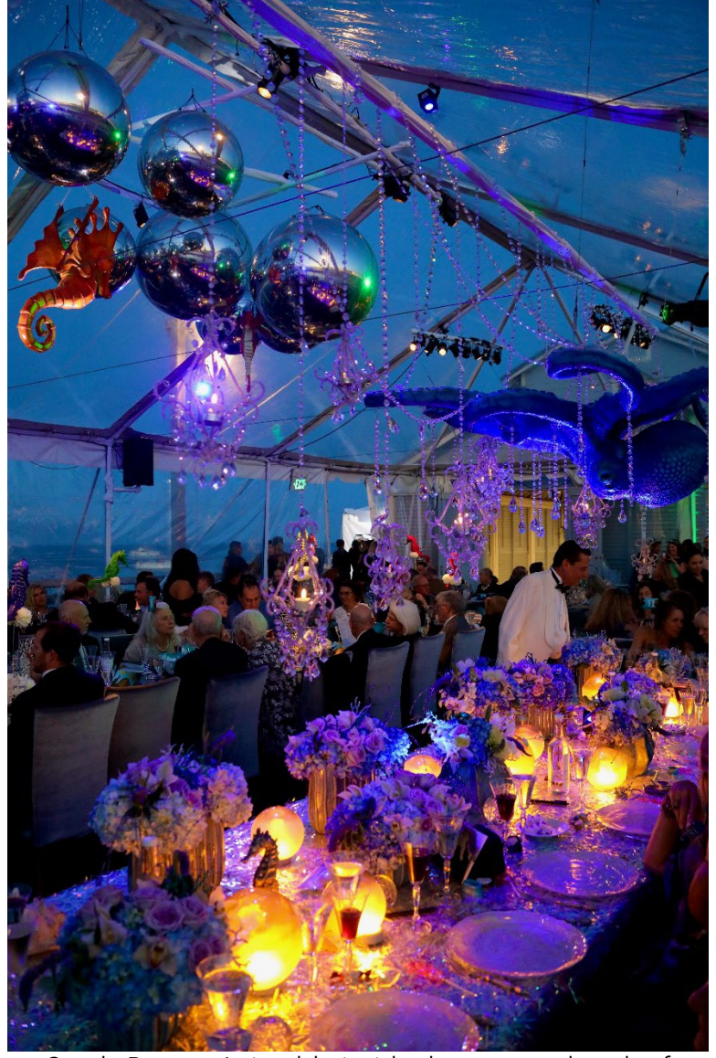
Sandy Bottom Lair table inside the tent on the wharf