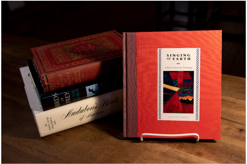
Beautiful books being offered for sale by the Museum Library