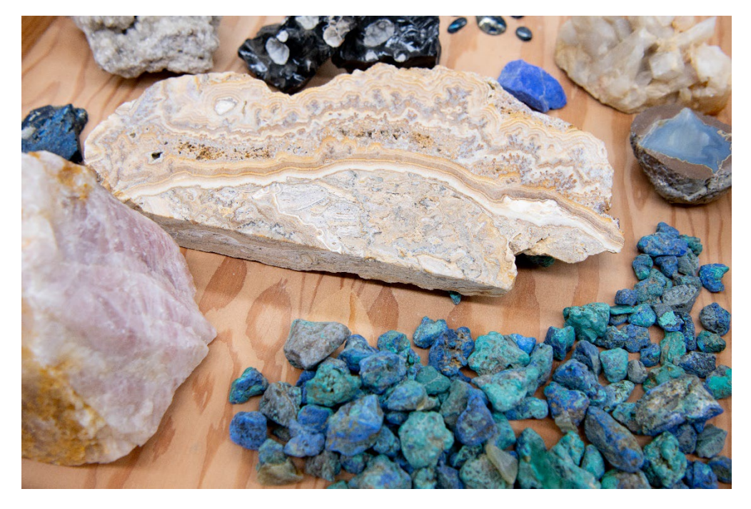
Rose quartz (left), travertine (center), and azurite (right) and more will be on sale to benefit earth science research