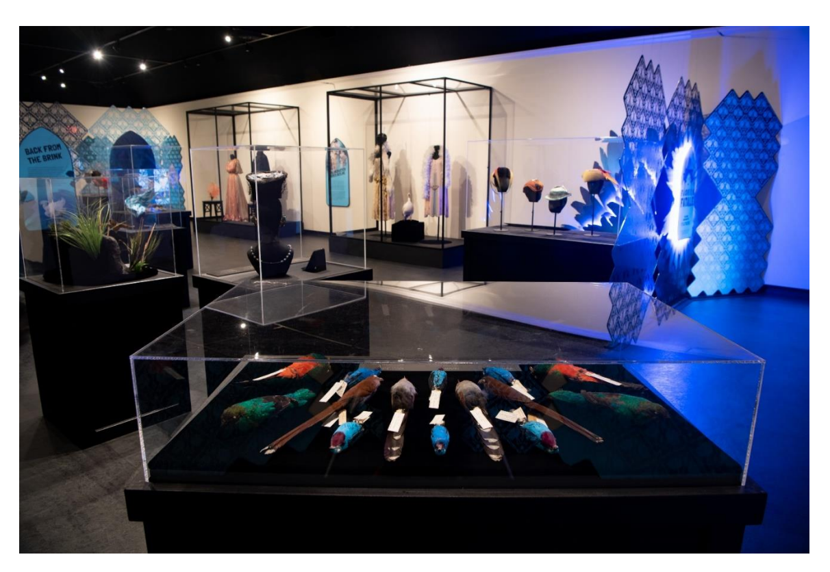
Fashion Fatale combines natural history specimens with historic apparel to tell a story about fashion and the environment.

Located in the heart of downtown Santa Barbara, the museum is a vibrant center for events and discovery of our city's past. The Museum is committed to creating meaningful connections to Santa Barbara history. For more information visit sbhistorical.org