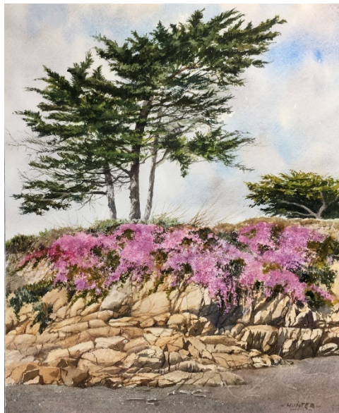
Rocky Bank Moonstone Beach, 8"x10" , oil on canvas by Ray Hunter