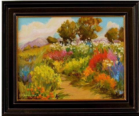
Favorite Trail , 11"x14", oil on canvas by Elle Freudenstein