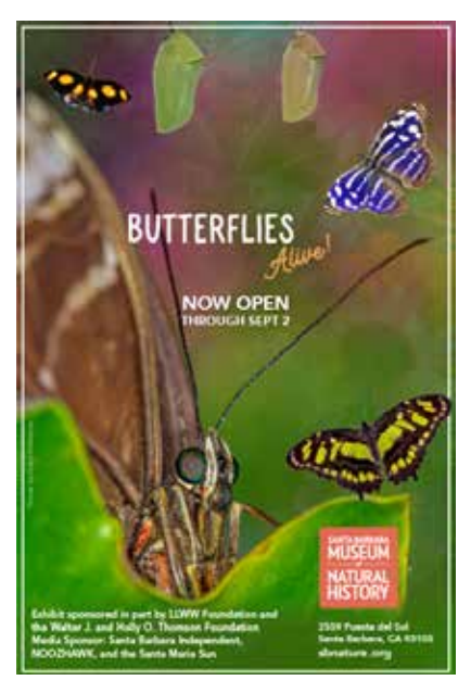
print ad recognition