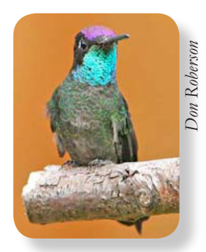
Magnificent Hummingbird Costa Rica