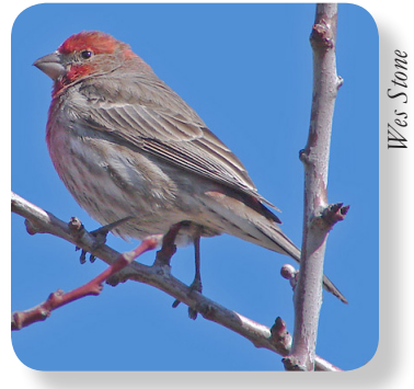
House Finch (male)