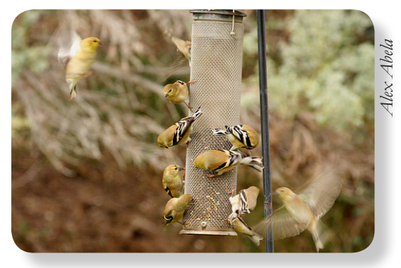
American Goldfinch (winter)

Mammals and birds are warm-blooded vertebrates.