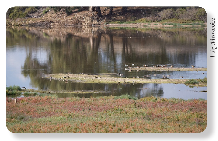
Devereux Slough Goleta Another good location for birding!

Park at the end of the parking lot and walk through four acres of riparian (located by water) woodlands. The tall trees, shrubs, and Mission Creek support many species of birds. This is an excellent location for listening to bird songs in the spring.