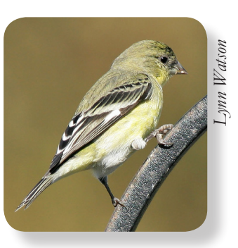
Lesser Goldfinch Santa Barbara