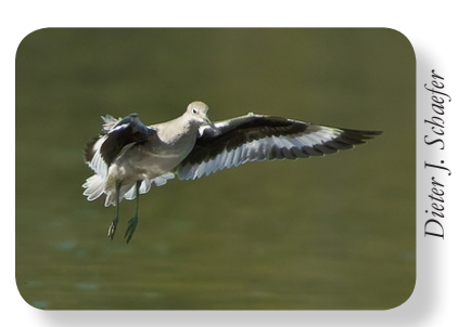
Willet in flight