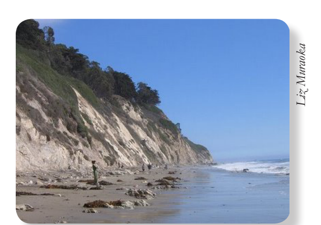
(Located off Cliff Drive just west of Los Positas Rd.)

Beach habitats offer plenty of food for shore birds. Time your visit for low tide and you will see birds feeding at tide pools where mussels and clams hold tightly to rocks.