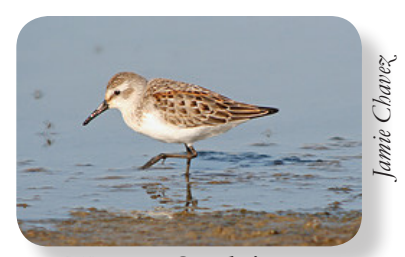
Western Sandpiper (winter)