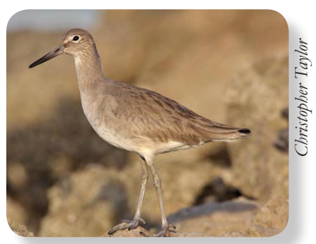
Willet (winter plumage)