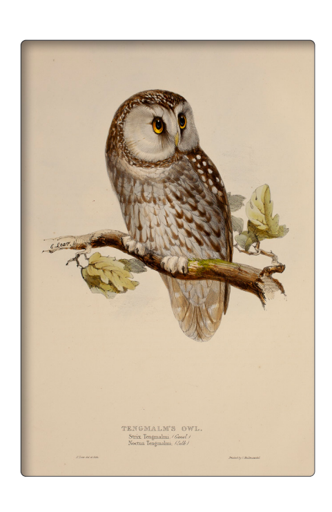
John Gould The Birds of Europe London hand-colored lithograph